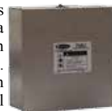
TO-SK-1 or GF-SK-1

Model "TO" & "GF" features include a positive "off" & a built-in on/off rocker switch that glows red during operation. Additionally, enclosure can mount directly to the terminal box on the back of the heater (FSP-43/95 only) or be mounted to a remote wall surface.